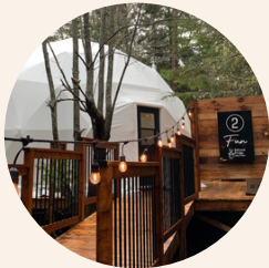
Balsam Ridge Forest Domes 2 night honeymoon stay