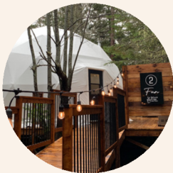
Balsam Ridge Forest Domes 2 night honeymoon stay