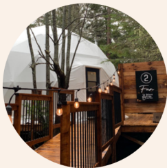
Balsam Ridge Forest Domes 2 night honeymoon stay